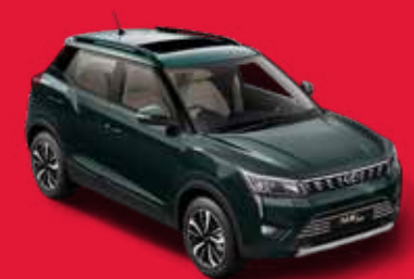
Aquamarine [on W4 only]