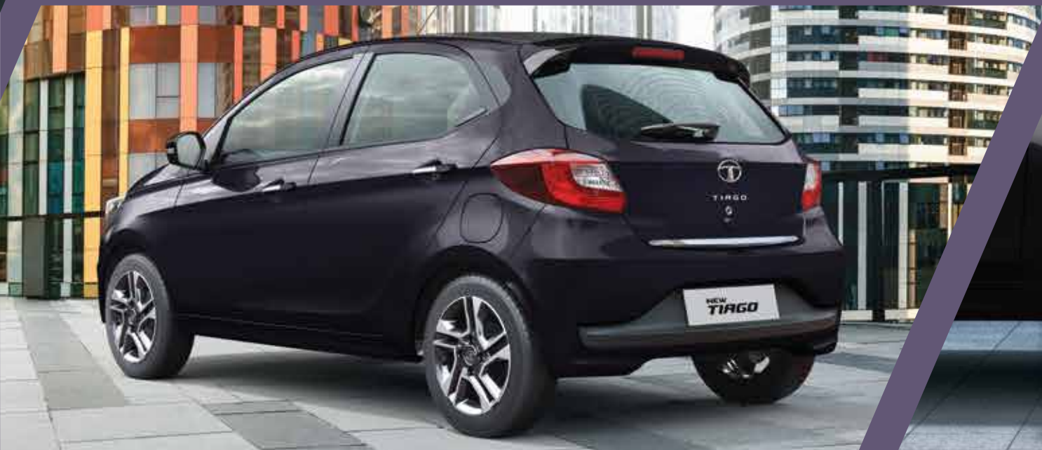
Chrome garnish on Tail Gate and Door Handles