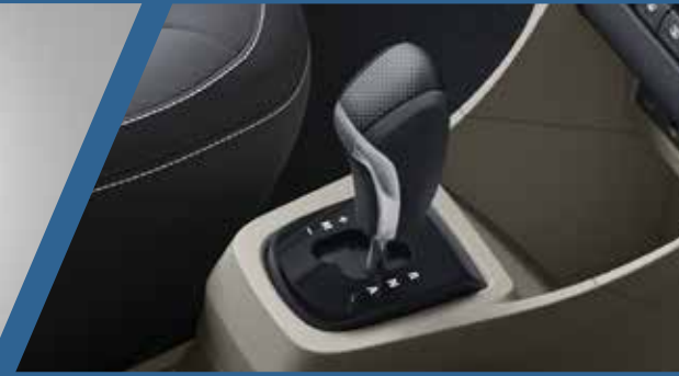
Advance AMT Transmission