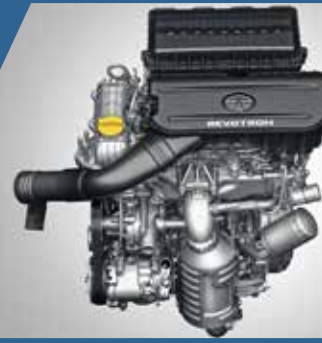
Max Power-86 ps @ 6000 r/min

Who says a peppy drive can't be thrilling? The Advanced AMT Transmission of Tiago lets you zip through any road without shifting a gear. The 1.2 L Revotron BS6 Ph2 petrol engine with the power of 86 ps @ 6000 r/min gives you an all-round performance.