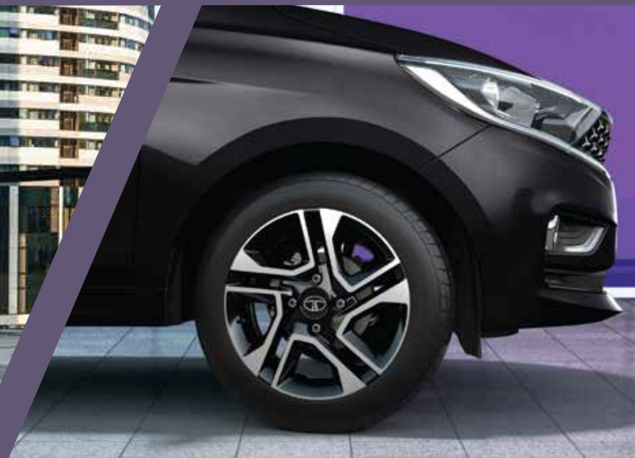
Trendy Dual Tone Alloy Wheels