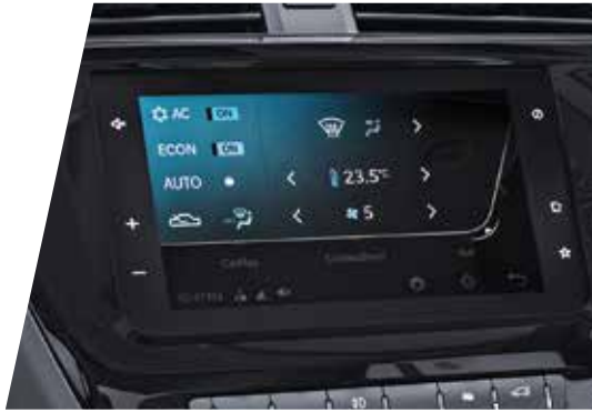
FULLY AUTOMATIC CLIMATE CONTROL