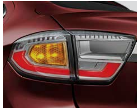
BOLD & BRIGHT LED TAIL LAMPS