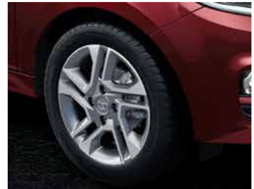
R15 SONIC SILVER ALLOY WHEELS