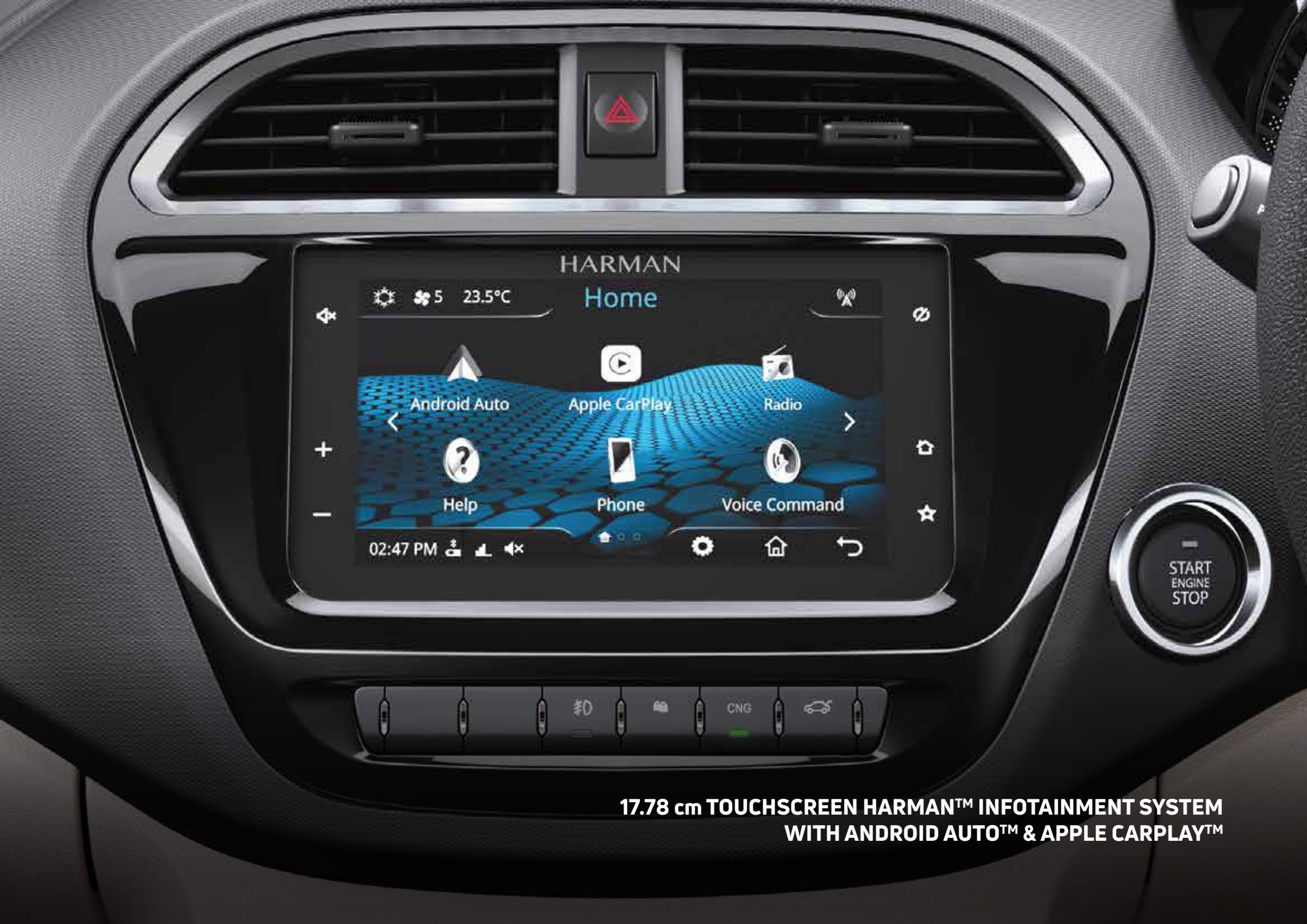
17.78 cm TOUCHSCREEN HARMAN™ INFOTAINMENT SYSTEM WITH ANDROID AUTO™ & APPLE CARPLAY™