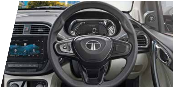
STEERING MOUNTED CONTROLS