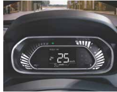
DIGITAL INSTRUMENT CLUSTER