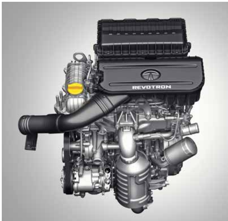
1.2L REVOTRON BS6 PH2 ENGINE