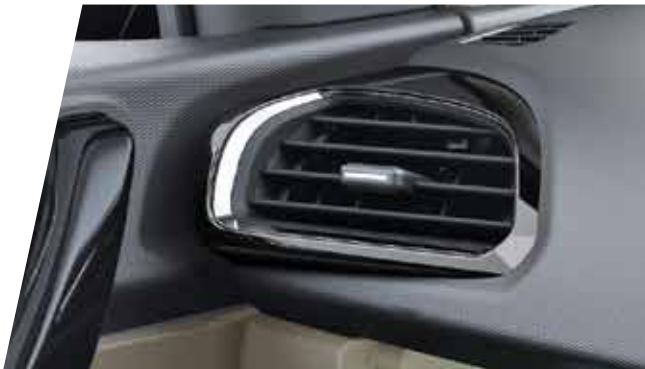
CHROME LINED SIDE AIRVENTS