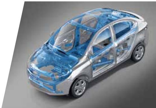
ENERGY ABSORBING STRUCTURE