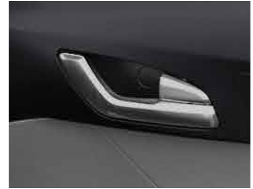
FRONT & REAR CHROME DOOR HANDLES