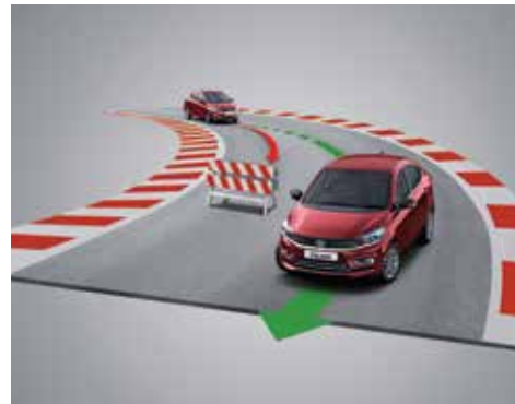
ABS WITH EBD AND CORNER STABILITY CONTROL