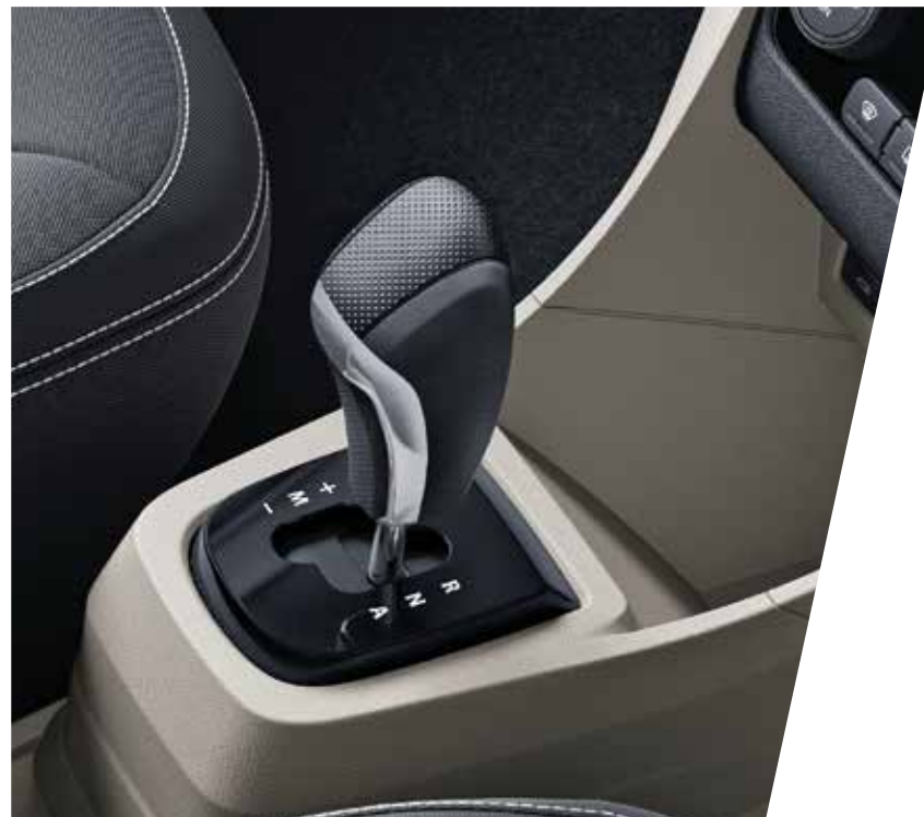
ADVANCE AMT TRANSMISSION