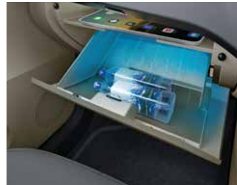
COOLED GLOVE BOX