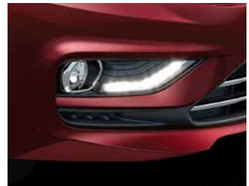
FRONT FOG LAMPS WITH CHROME RING SURROUNDS