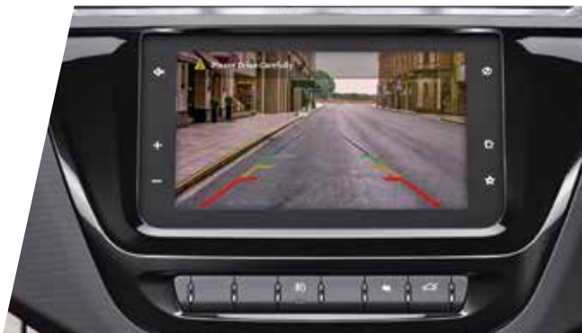
REAR PARKING ASSIST WITH CAMERA