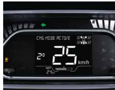
TYRE PRESSURE MONITORING SYSTEM