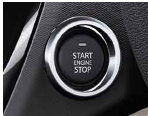
ENGINE START/STOP PUSH BUTTON