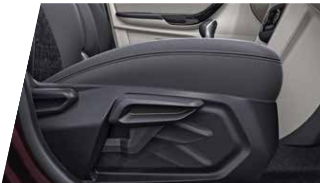
HEIGHT ADJUSTABLE DRIVER SEAT