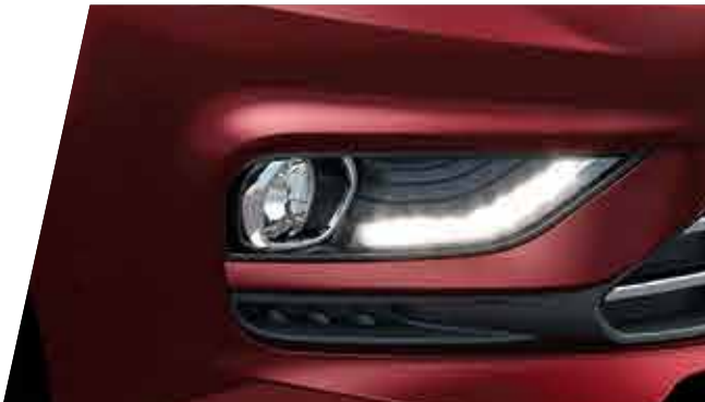
STRIKING LED DRLs