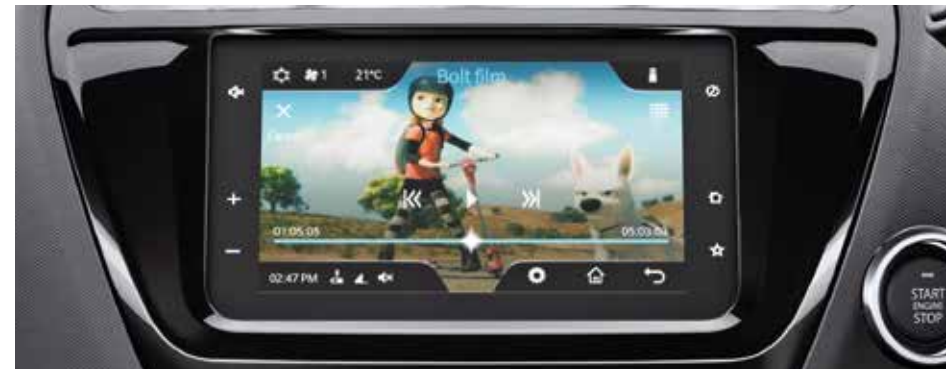
IMAGE & VIDEO PLAYBACK