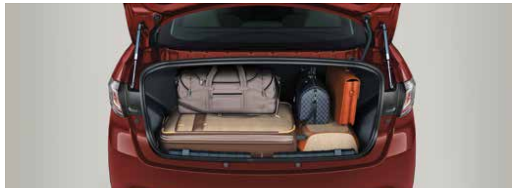
419L BOOT SPACE