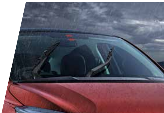
RAIN SENSING WIPERS