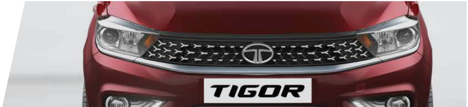
STYLISH CHROMED TRI-ARROW FRONT GRILLE